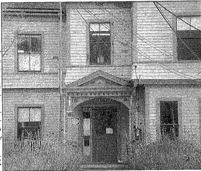
The Brigham House, prior to CPC-funded maintenance and restoration